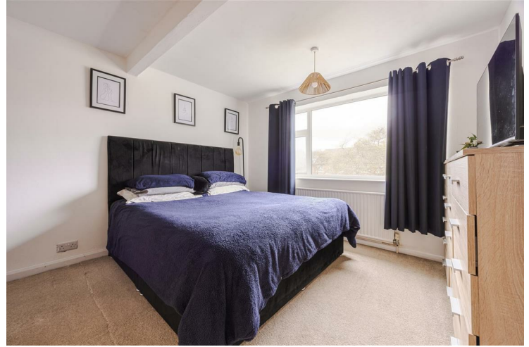
Bedroom one 11'10" x 11'4" (3.62 x 3.46)