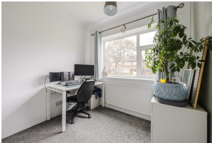
Study 8'5" x 8'0" (2.58 x 2.46)