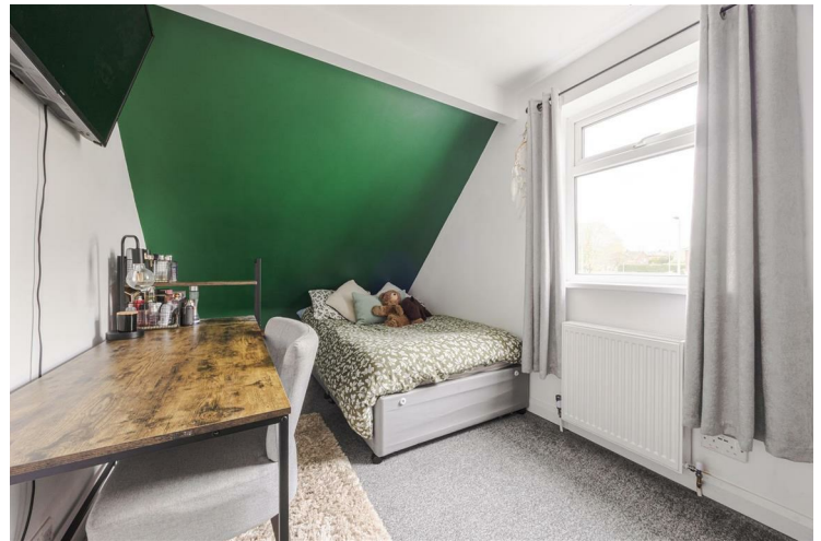
Bedroom two 12'11" x 8'0" (3.96 x 2.46)